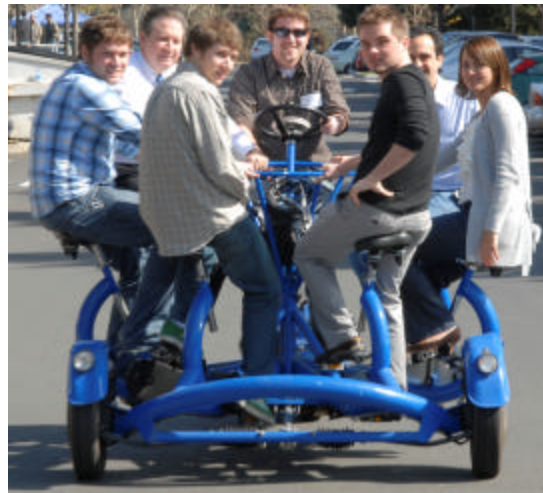
College Team - Aspiring